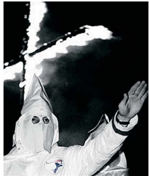
1865 Klu Klux Klan is formed

"All persons held as slaves are, and henceforward shall be free"